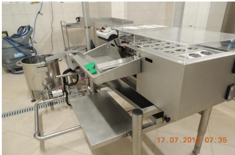
Egg cracking machine