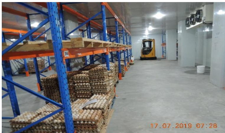
Main cold room